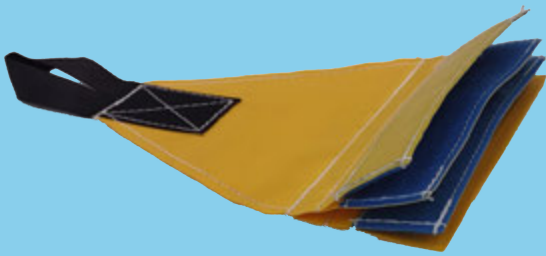
Lateral support with hook to retain the velvet seal of the fence

The side supports are necessary to hold the water barrier securely against a straight wall. For the WL-26 category, it is recommended to have 4 retaining brackets to properly retain the end of the barrier on the right. These brackets are universal for all our models and sold in pairs for both the left and right side.